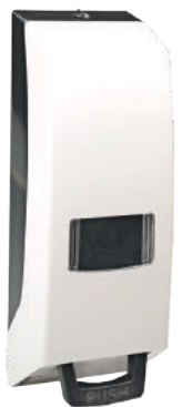
VOORMATEC SF4 PLASTIC DISPENSER