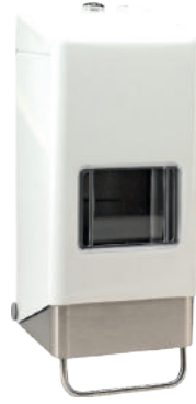
PEVAMAT SF STAINLESS STEEL DISPENSER

FOR 1 L + 2 L SOFT BOTTLES, WHITE CAP, POWDER COATED, WITH AND WITHOUT LOCK