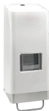
PEVAMAT SF4 STAINLESS STEEL DISPENSER

FOR 4 L SOFT BOTTLE, WHITE CAP, POW- DER COATED, LOCKABLE