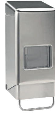
PEVAMAT SF STAINLESS STEEL DISPENSER

FOR 1 L + 2 L SOFT BOTTLES, SATIN BRUSHED METAL CAP, LOCKABLE