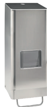
PEVAMAT SF4 STAINLESS STEEL DISPENSER

FOR 4 L SOFT BOTTLE, SATIN BRUSHED METAL CAP, LOCKABLE