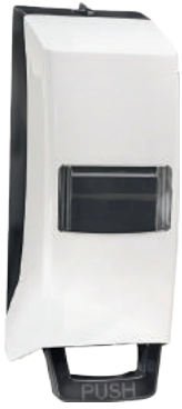
VOORMATEC SF2 PLASTIC DISPENSER

FOR 1 L + 2 L SOFT BOTTLES, WHITE OR SILVER LACQUERED CAP